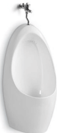
U.518-(B/B) Wall Hung Urinal ONLY

Dim: L360 x W315 x H470mm Top inlet (Fix)