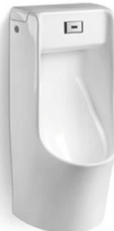
U.520 Wall Hung Urinal with Integrated Sensor