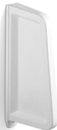
U.000 Urinal Divider

Dim: L370 x W320 x H760mm Back outlet (Modifiable)