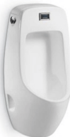
U.519 Wall Hung Urinal with Integrated Sensor

Dim: L355 x W303 x H685mm Back inlet (Modifiable)