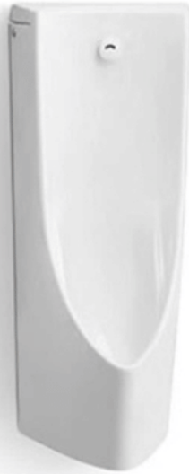
U.525 Floor Standing or Wall Mounted Urinal with Integrated sensor (Rimless)

Dim: L380 x W405 x H1000mm Bottom outlet (wall to outlet 160mm)