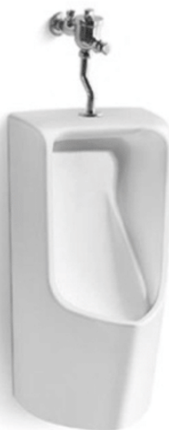
U.515-(T/B) Wall Hung Urinal ONLY

Dim: L395 x W345 x H730mm Back inlet (Modifiable)