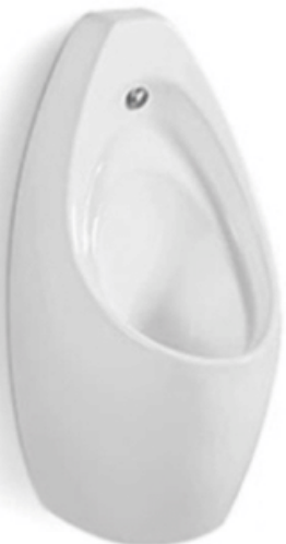
U.505 Wall Mounted Urinal with Intergrated Sensor (Rimless)

Dim: L350 x W 395 x H750mm Back outlet (Modifiable)