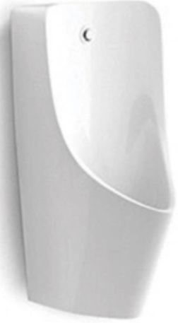
U.528 Wall Mounted Urinal with Intergrated Sensor (Rimless)

Dim: L380 x W420 x H960mm Back outlet (Modifiable)