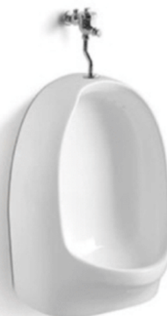
U.517-(T/BTM) Wall Hung Urinal ONLY

Dim: L380 x W320 x H770mm Top inlet (Fix)