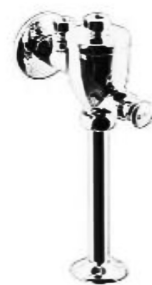
FV-310 Manual Flush Valve