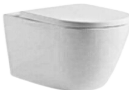
P.030H (Rimless) (Handicap)