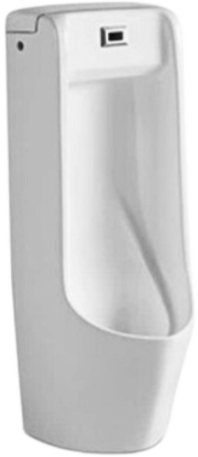
U.522 Floor Standing Urinal with Integrated Sensor

Dim: L380 x W405 x H1000mm Bottom outlet (wall to outlet 160mm)