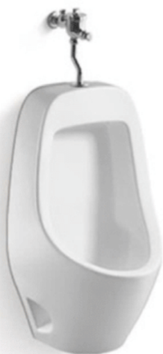
U.513-(B/B) Wall Hung Urinal ONLY

Dim: L395 x W345 x H730mm Back inlet (Modifiable)